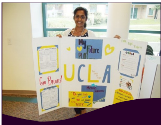
COLLEGE PREP ACADEMY

It was all about the sophomores during College Prep Academy. Students attended workshops facilitated by UC Riverside's Career Center, Academic Resource Center, and Undergraduate Admissions. After a week of college prep presentations, financial aid workshops, and team building activities, students left the program with a wealth of college knowledge and new friendships.